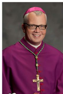
Bishop Donald Hying